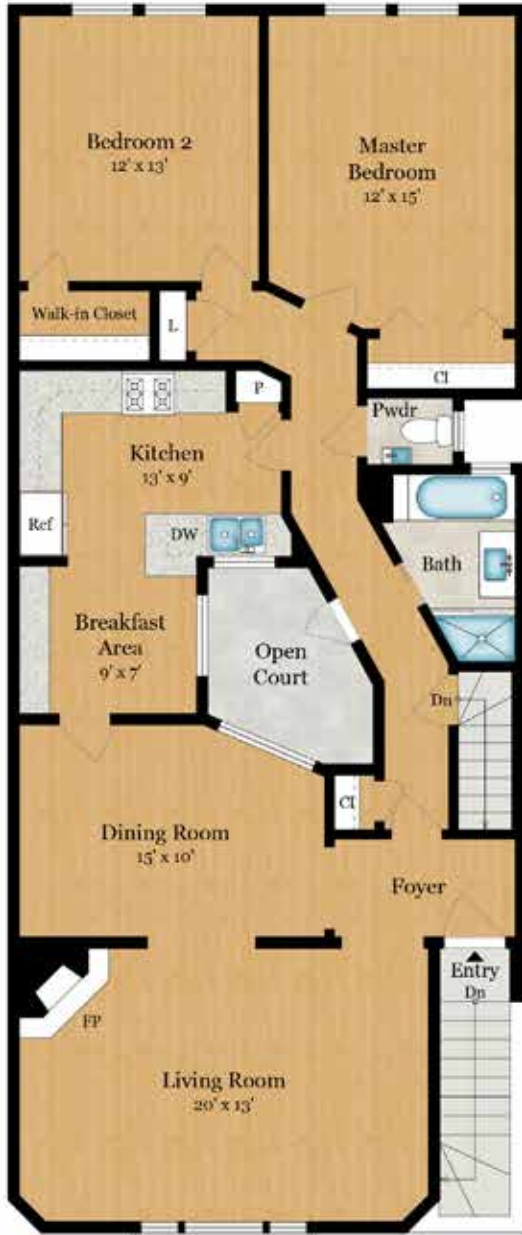
MAIN LEVEL 1,340 SQ FT

* Estimated Total Finished & Unfinished Square Footage: 2,635 SQ FT